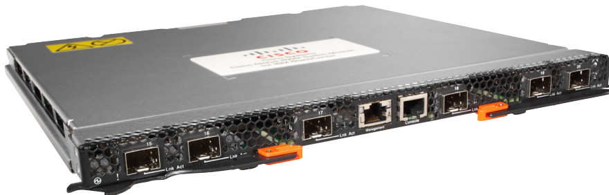
Figure 1. Cisco Nexus 4001l Switch Module for IBM BladeCenter

Cisco Nexus 4000 Series switches are purpose-built to provide the server access foundation required for scale-out virtualized x86 computing architectures built on high-density blade servers. The Cisco Nexus 4000 Series is an all 10-Gbps Fibre Channel over Ethernet (FCoE) switch that is fully compliant with the IEEE 802.1 Data Center Bridging specification. The Cisco Nexus 4000 Series extends the benefits of the Cisco Nexus Family of data center switches to blade servers, the fastest growing segment of the scale-out x86 server market. The Cisco Nexus 4000 Series provides innovative architecture to simplify data center transformation, enabling a standards-based, high-performance Unified Fabric over 10 Gigabit Ethernet in the blade server environment. This Unified Fabric enables consolidation of LAN traffic, storage traffic (IP-based such as iSCSI, network-attached storage [NAS], and Fibre Channel SAN), and high-performance computing (HPC) traffic over a single high-performance, 10 Gigabit Ethernet server access link.