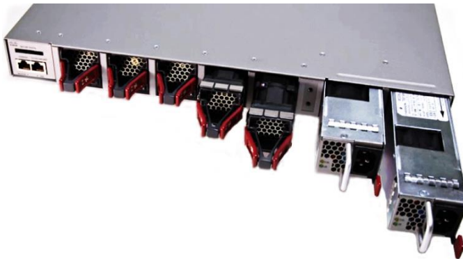
Figure 6. Redundant Fan and Power Supply

Cisco Catalyst 4500-X switch provides redundant hot swappable fans and power supplies (Figure 7) for highest resiliency with no single point of failure.