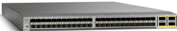
Figure 3. Cisco Nexus 6001 Chassis

The Cisco Nexus 6004 and 6001 use a custom-built application-specific integrated circuit (ASIC) to deliver Layer 2 and Layer 3 features at line rate. Using the state-of-the-art Cisco ASICs, the Cisco Nexus 6000 Series supports the large buffer capacity and low latency between ports required for latency-sensitive environments. Cisco Nexus 6000 Series Switches support industry-leading fabric extender architecture with Cisco Nexus 2000 Series Fabric Extenders and the Cisco Nexus B22 Blade Fabric Extender, In-Service Software Upgrade (ISSU), and Cisco FabricPath. Operating efficiency and programmability are enhanced on the Cisco Nexus 6000 Series through advanced analytics, Power-On Auto-Provisioning (POAP), and Python Tool Command Language (TCL) scripting.